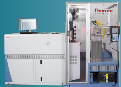
ARL SMS-2300 with ARL iSpark

For unattended on-site analyses, these systems can be supplied in a standard container: the Thermo Scientific™ ARL™ QuantoShelter, also called “the lab in a box.”